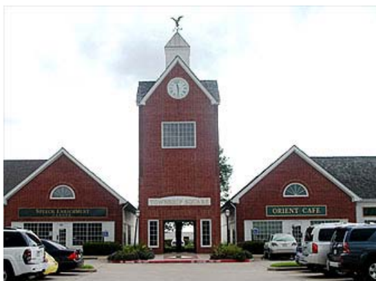
Township Square of Missouri City

Families enjoy the several master planned residential communities and parks and an acclaimed school district.